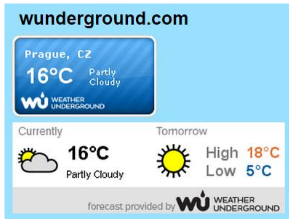
Picture 4: Example of two versions of widgets available on wunderground.com